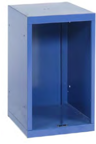
Primary Jr. Cubbie