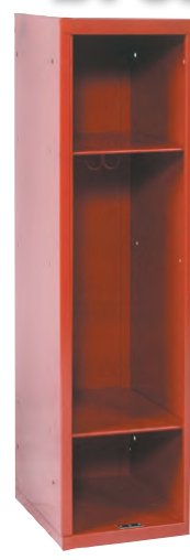
Primary II Cubbie